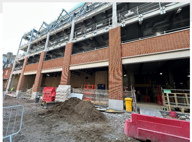
South Building – First phase of precast façade panels installed