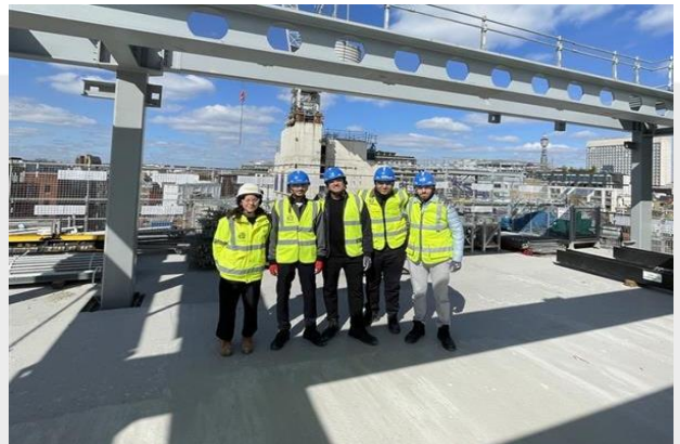
City St George Students Site Visit