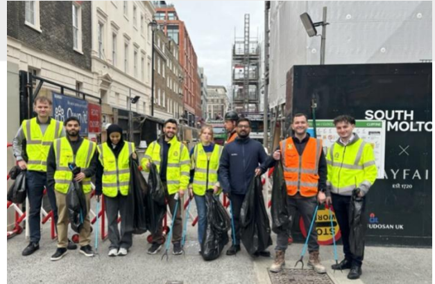
Members of the Skanska project team taking part in the Spring Clean