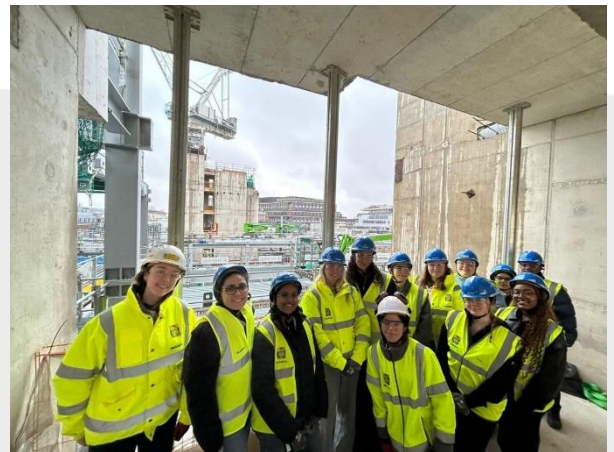
ICE Early Careers Team – Women in Construction Site Visit

March saw South Molton celebrating Women in Construction with a visit from the ICE Early careers team. The visit included a presentation from the project team to introduce the development of the North and South Blocks, highlighting project stakeholders and the collaboration within the project team between architects, engineers and contractors to deliver this complex project. Attendees were then taken on a tour of the site to see examples of project engineering and hear from some of the women who are working to make this project possible.