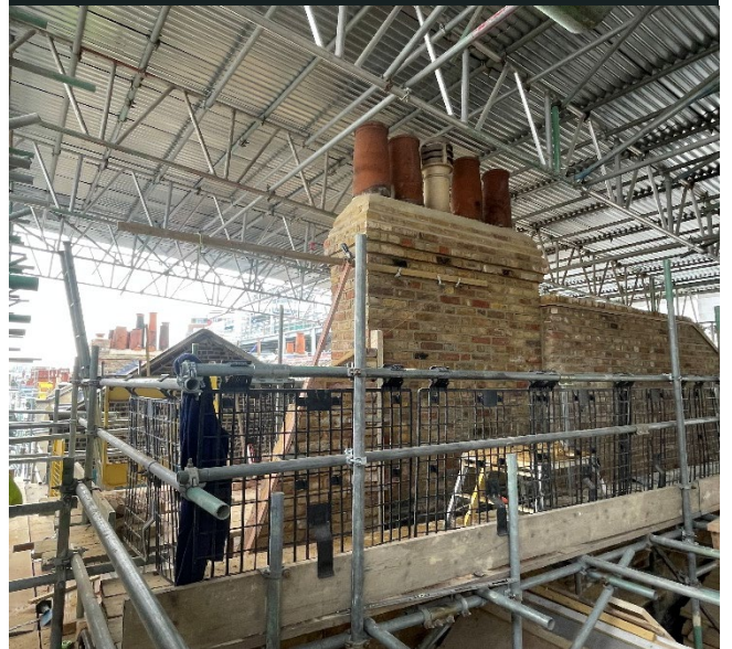
23 roof Extension brickwork

In April, works will continue with the installation of structural steelwork and structural timber to form the roof shape, including new mansard roofs to the front and rear, with dormer windows incorporated.