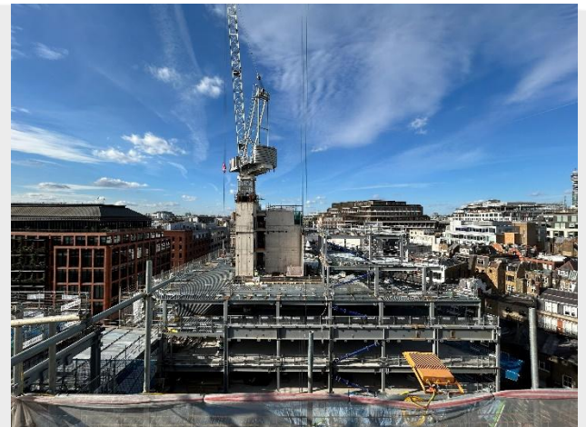
North Building Progress