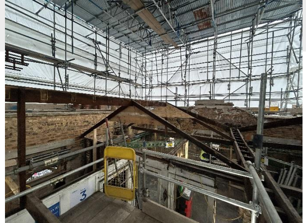
Roof restoration progress at the Running Horse Pub