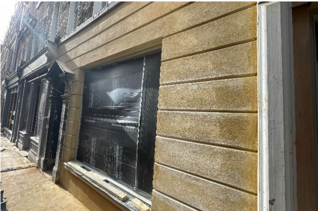
21 SMS Newly Rendered Shopfront

Now the shopfront window panel has been installed, and the render is complete we are one step closer to completing the transformation of this historic shopfront.