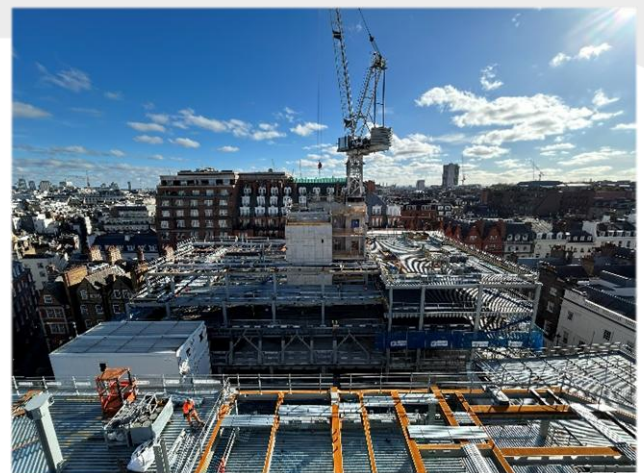
South Building Progress