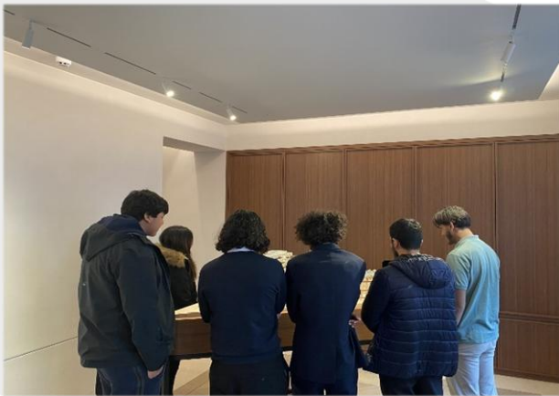
Students examining the model of the South Molton development