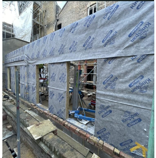
Picture of first-floor terraces at 20 & 21

Following this, waterproofing will be installed, allowing us to move into the next phase of the project and begin the internal fit-out of the apartments.