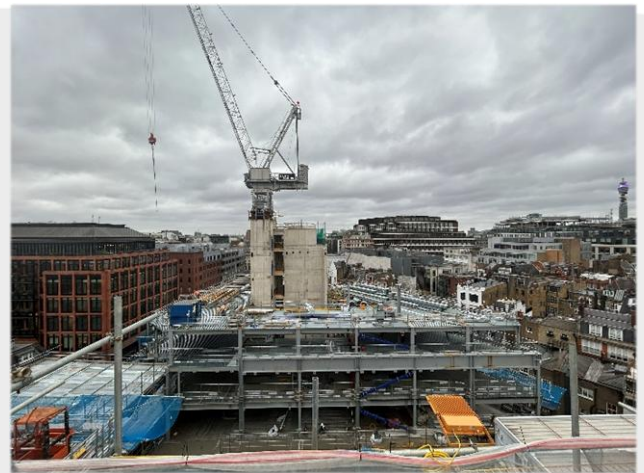
North Building Progress