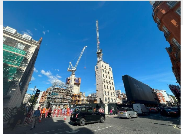
Tower Crane Erection

At Skanska, we understand that construction work can be quite disruptive to the local community. We appreciate your patience and understanding, and we will continue to make every effort to minimise any inconvenience to you.