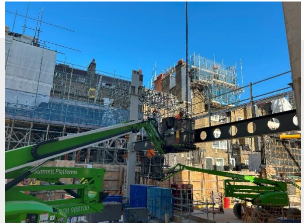
Steel erection in the North Block