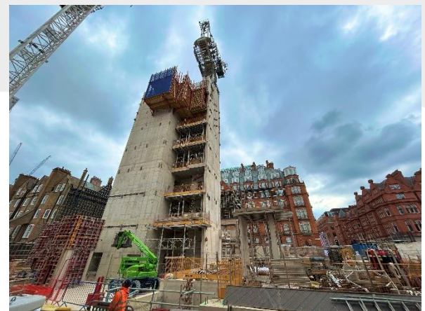
South Block core erection