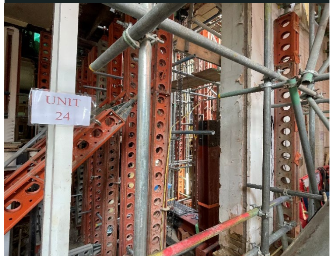
23/24 Party wall demolition

Looking ahead to October, the next phase of works will involve installing a steel frame to support the newly created opening. Following this, a second steel frame will be installed on the rear external wall of unit 23. Additional demolition works will also continue along the shared party wall between units 23 and 24.