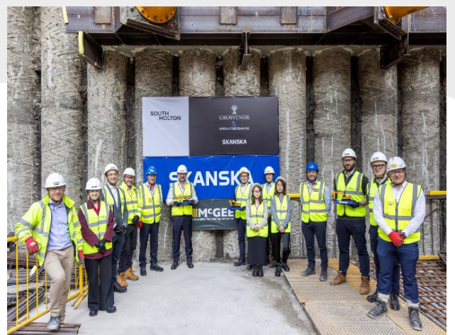
Bottoming out ceremony- celebrating reaching the deepest point of the project