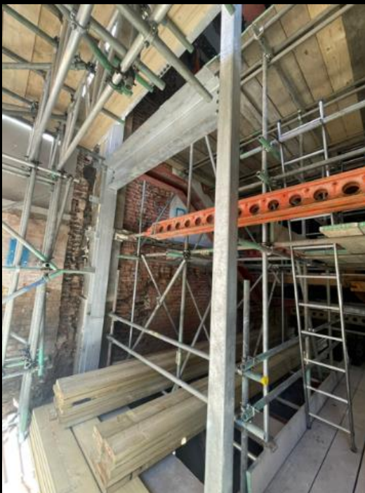
New steel frame in Unit 10