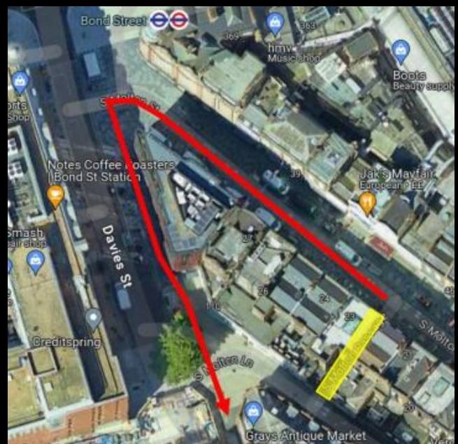
Diversion Route shown in red

Clear signage has been placed along the diversion route to guide pedestrians. Footpath closure signs are displayed at both South Molton Street and South Molton Lane entrances, with the passageway secured using timber hoarding for public safety.