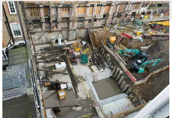
Completion of excavation to B1 level to the South Block

At Skanska, we understand that construction work can be quite disruptive to the local community. We appreciate your patience and understanding, and we will continue to make every effort to minimise any inconvenience to you.