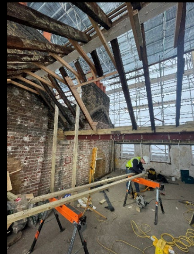
New and strengthened rafters in roofs of 15 and 16 SMS