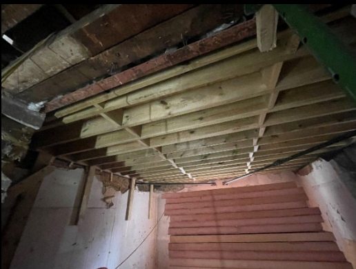
New terrace joists installed into 1 st floor of 15 SMS

This new concrete slab and steel framework lays the foundations to allow us to build a new vibrant micro retail unit along SML.