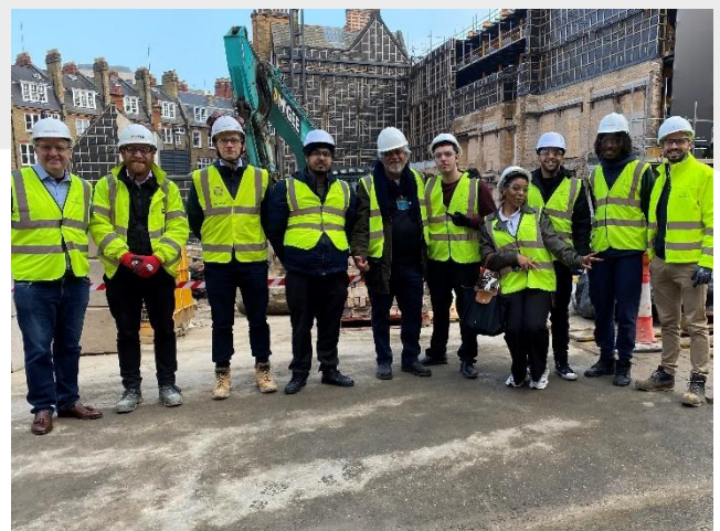
Chocolate Makers Programme site visit 5 th November