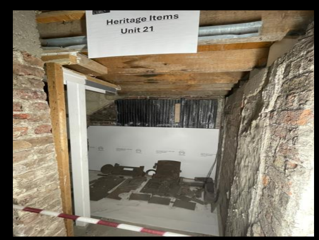
Safe storage of heritage items discovered on site

We have made a special home for the safekeeping of heritage items discovered on site. These will be kept and protected until they can be reinstated once works have been completed.