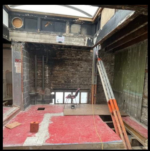
Internal and external temporary works installed at 17 SMS