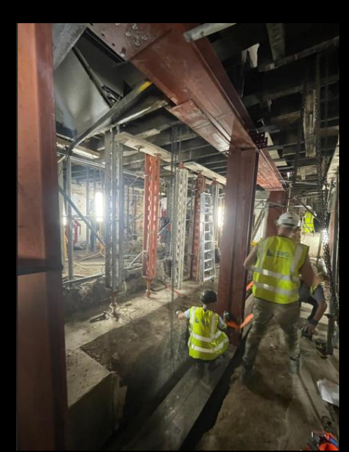
Installation of steel frame to 15/16 SMS basement